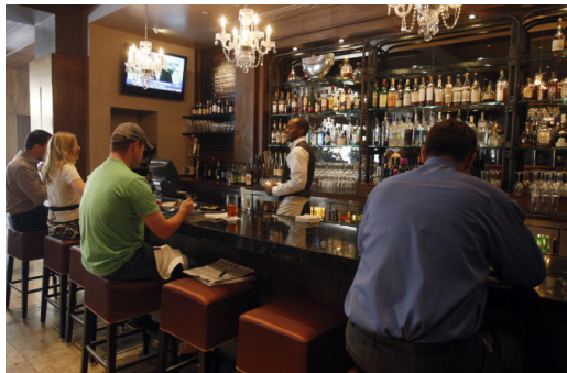
From top to bottom, Maggiano's & LB Steak.

Santana Row has a dining option for any occasion, from family nights to a wild night out with friends, you are guaranteed to find just what your social life needs.